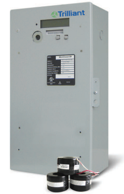
Trilliant® MiniCloset-5c Residential, Front View

For typical 120/280V 2-phase residential installations, the MiniCloset-5c (MC-5c) requires 2 CTs per apartment. The MC-5c can monitor up to a total of 12 apartments using 24 CTs (12 apartments x 2 CTs per apartment). Each CT will connect to the MiniCloset Interface Board (MCI) which is in the enclosure. Installations will vary based on the configuration of the meter.