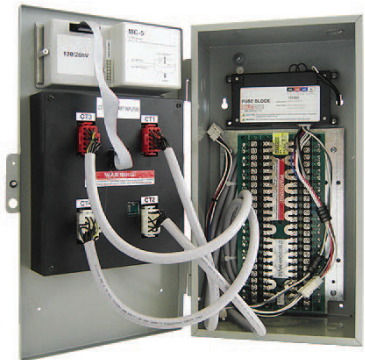
Trilliant® MiniCloset-5c Residential, Opened